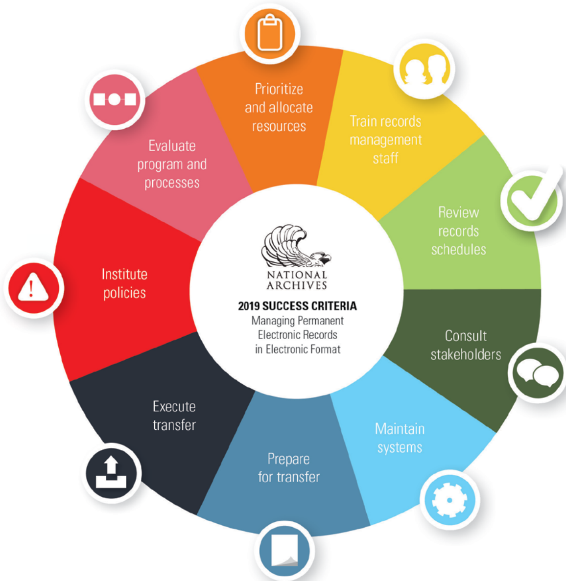
Figure 2: Operational Activities Wheel

your agency's records management program. Due to the variances in size, structure, culture, and other factors, agencies may need to incorporate additional activities to meet their business needs.