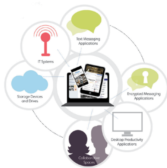
Figure 1: Location for Electronic Records

This document also includes a crosswalk for these three sections demonstrating the relationship between them to clarify how these products assist agencies on a path to success.