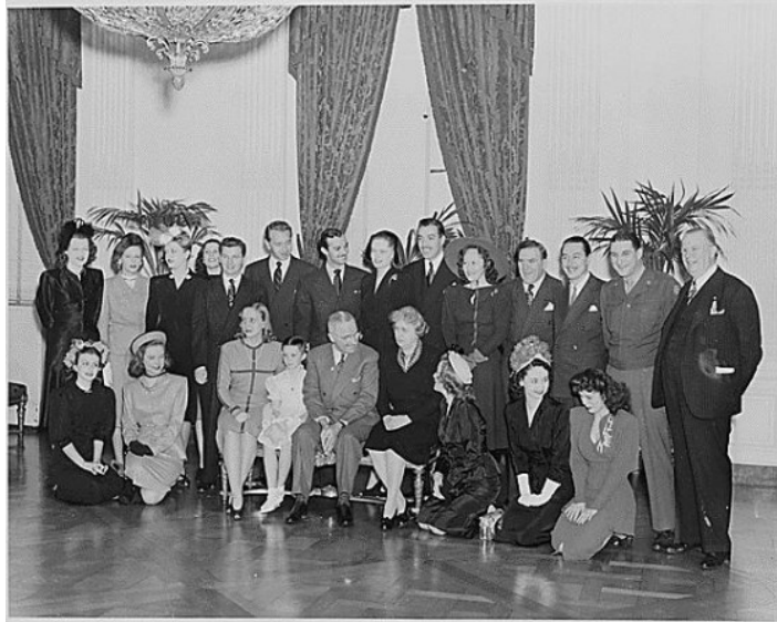
Above: Photograph of movie stars posing with President Truman and his family at the White House, January 28, 1946.